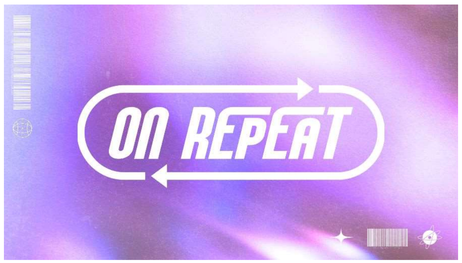
ON REPEAT: A 3-Week Series from the Book of Mark on Loving Like Jesus

Have you ever found a playlist that felt like it was made exactly for you? When music connects with us, we'll want to play the songs on repeat because we never get tired of hearing them. When Jesus taught his followers what it looked like to live for God, he wanted them to get that same feeling, too. In this 3-week series from the book of Mark, we'll take a look at how we can make loving like Jesus a daily part of our lives. He shows us that listening , loving others, and offering encouragement are worth repeating .