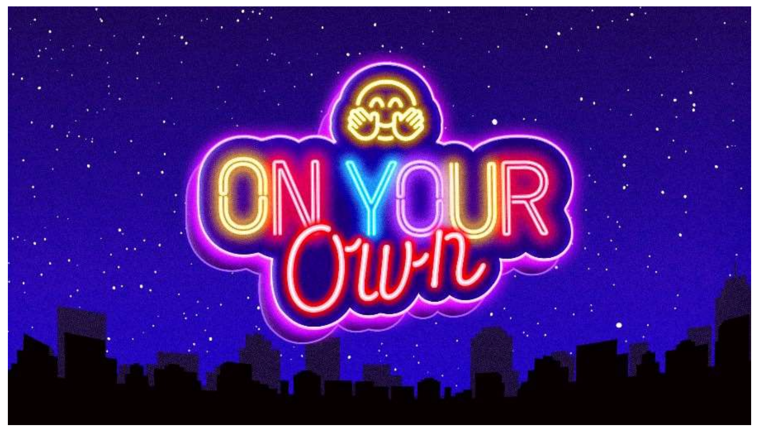
ON YOUR OWN: A 4-Week Series from the Old and New Testament on Godly Friendships

Game shows can reveal the real strength behind friendships. Whether we're asking for help, solving puzzles, or overcoming challenges, quality friendships can help us move on to the next round of competition. So, what does it look like to develop game-winning friendships? In this 4-week series from the Old and New Testaments, we'll explore how godly friendships can make a difference when we're in the hot seat. We'll see how God's words can help our friendships grow , how our friends can help our faith grow , the ways God can help us choose our friends wisely , and how God can help repair broken friendships .