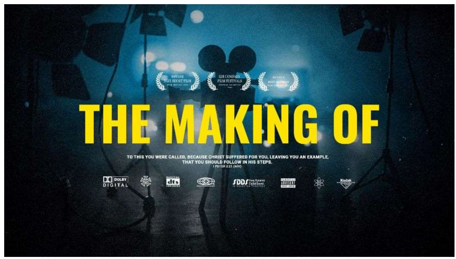
THE MAKING OF: A 2-Week Series from the New Testament on Spiritual Formation

Good movies capture our imaginations and transport us to other worlds. As we watch our favorite movies with popcorn in hand, we may not realize all of the work, edits, and rewrites that went into making the cinematic masterpiece. The same is true of our faith, too. We might expect our relationship with God to look like a finished product, but really, our faith and relationship with God are still in the making. In this 2-week series from the Gospels and Epistles, we'll explore what can happen when we invest in spiritual formation. We'll discover how with God, difficult moments can help our character grow and how we grow when we make things right with God.