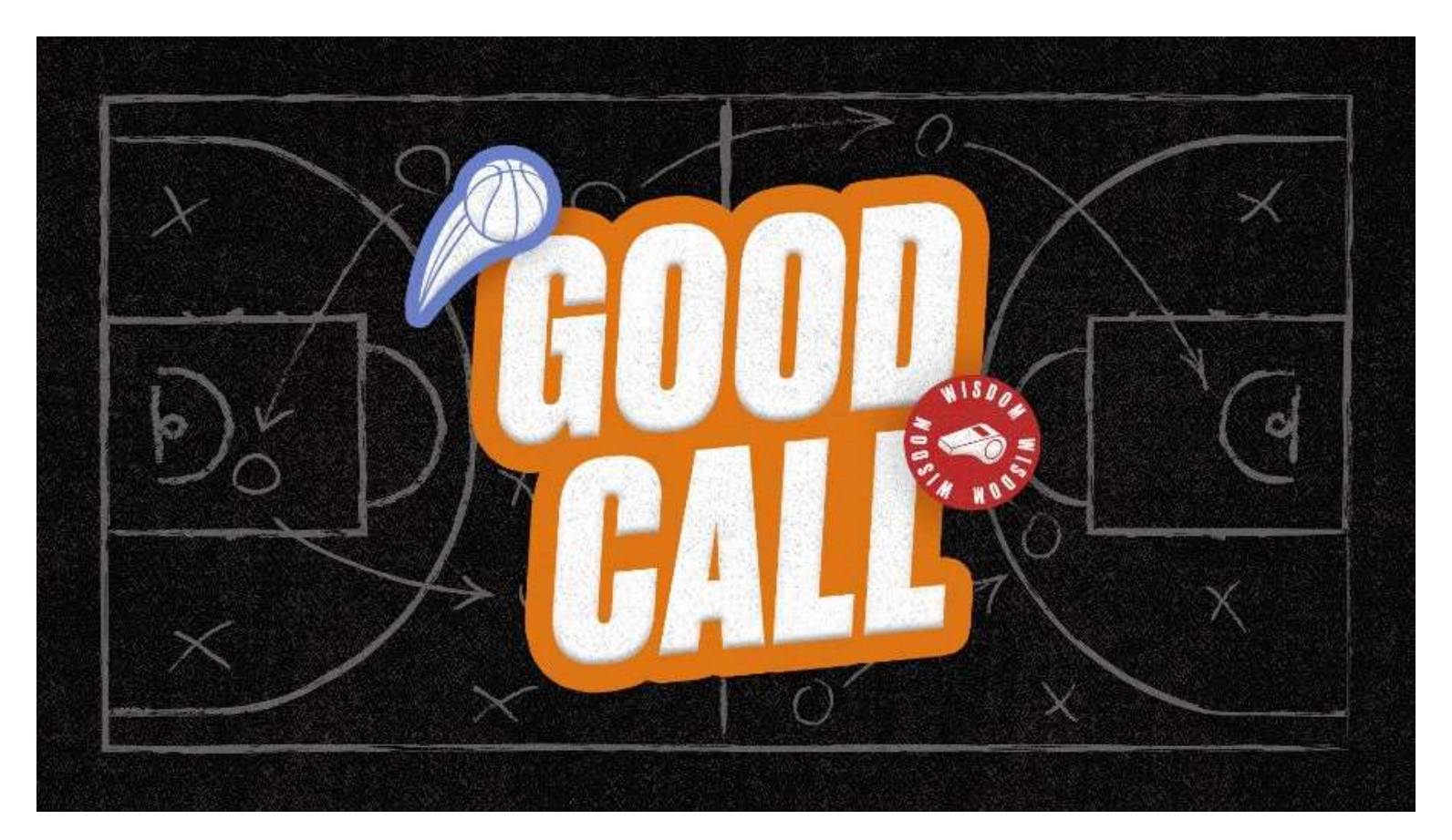
GOOD CALL: A 4-Week Series from Proverbs and the Epistles on Living Wisely

Coaches help their teams by guiding them towards good decisions. They create the strategy, put together a game plan, and send their players out to make it happen. Wouldn't it be nice for someone to do that for all of our decisions? Thankfully, God gives us wisdom whenever we feel like we could use a good coach. In this 4-week series from Proverbs and the Epistles, we'll learn more about the wisdom God offers us whenever we want to make godly decisions. We'll see that wise people practice what God has said and share what God has given them. We'll also look at how the Holy Spirit helps wise people follow God's guidance and how wise people's words show God's love.